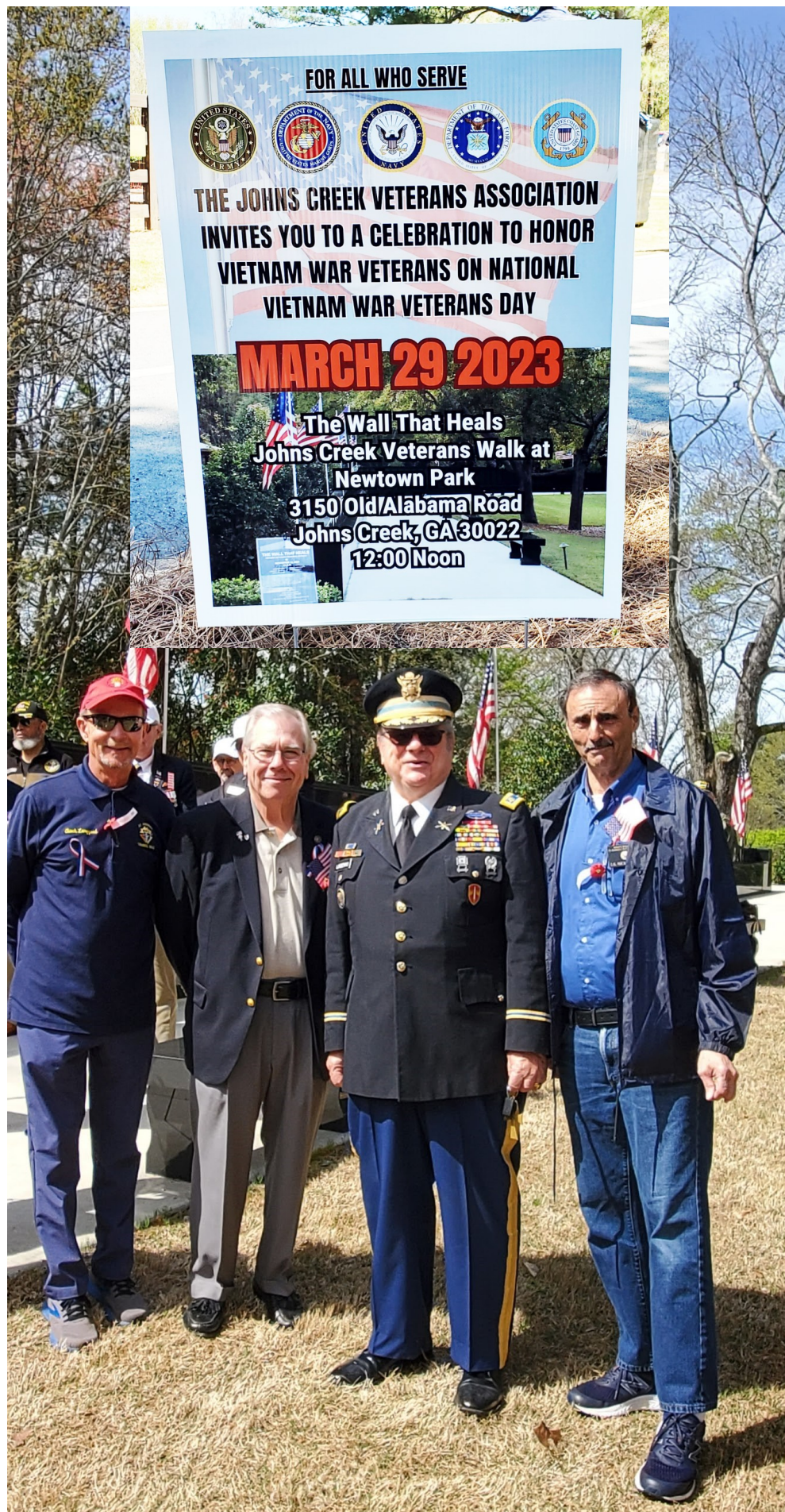
At the Johns Creek Vietnam War Veterans Day celebration on March 29th.