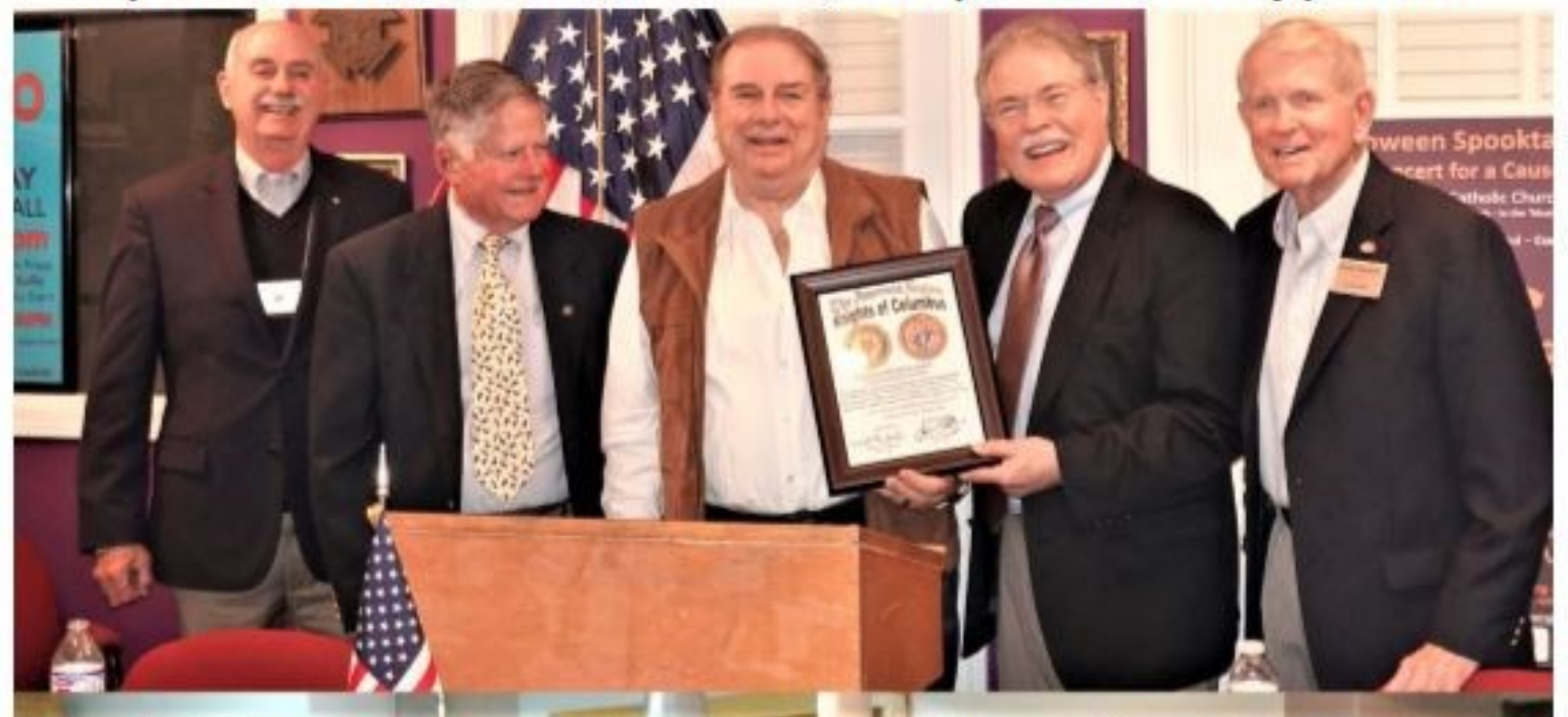
It wouldn't be a proper meeting without the presentation of a council certificate of appreciation to the main speaker, Mayor Mike Mason of Peachtree Corners.