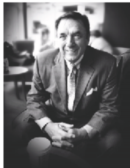
Born: December 23, 1939 Death: October 19, 2017