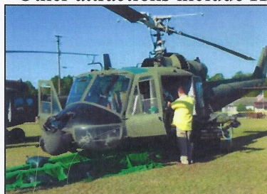
Four Different Original Vietnam Helicopter Displays

Other attractions include Helicopter and Photograph Displays!