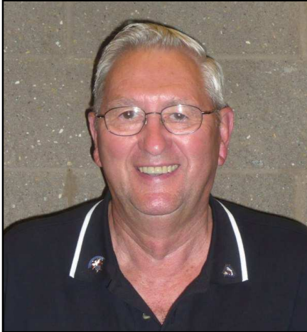
John Lewis Faithful Admiral St. Brigid