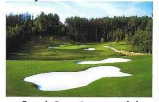
Bear's Best Country Club 5342 Aldeburgh Drive Suwanee, GA 30024

100% of the proceeds will be donated to the Veterans from 1976 & the Mid East Wars $150 Donation includes: Golf Breakfast/Lunch