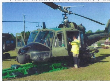
Four Different Original Vietnam Helicopter Displays

Other attractions include Helicopter and Photograph Displays!